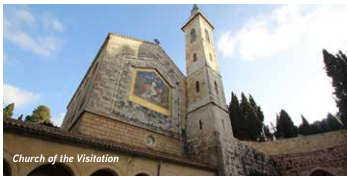
Church of the Visitation