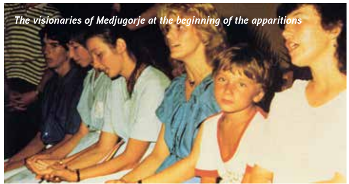
The visionaries of Medjugorje at the beginning of the apparitions