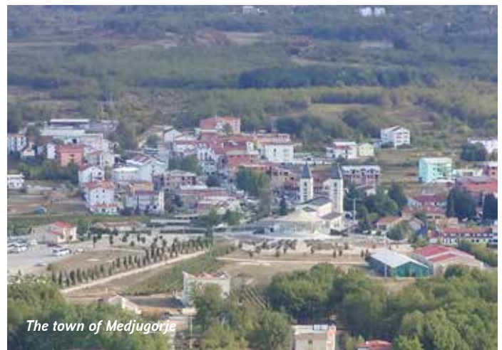
The town of Medjugorje