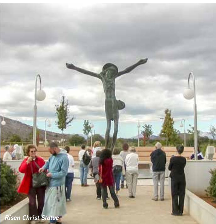
Risen Christ Statue