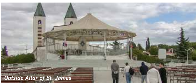
Outside Altar of St. James

Pilgrims will spend one day in the picturesque coastal town of Makarska, exploring the beauty of the Adriatic Coast. Next, you will spend seven days in Medjugorje, participating in the daily spiritual life of St. James Church, which includes the English Mass, the evening program of prayer and adoration, as well as additional activities as outlined in the itinerary.