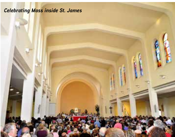
Celebrating Mass inside St. James