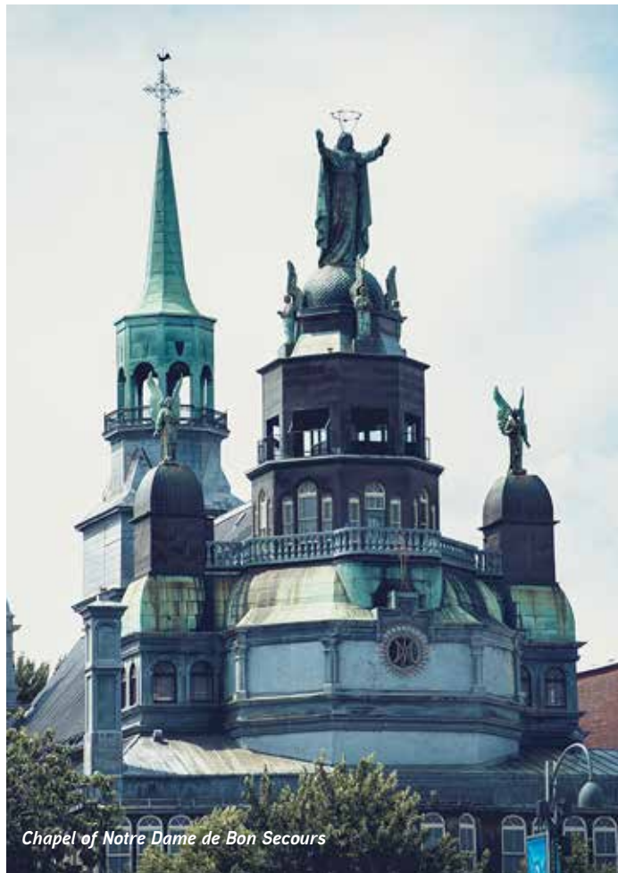
Chapel of Notre Dame de Bon Secours