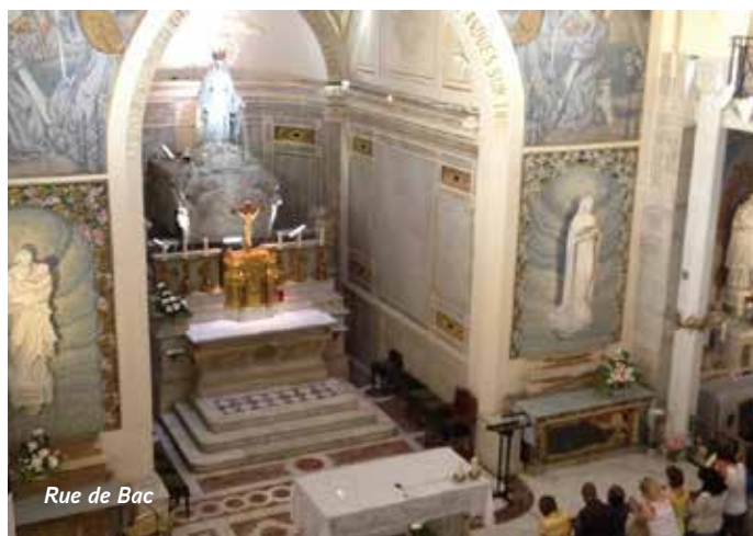
Rue de Bac

Today begins under the city, in the Catacombs of Paris (pending confirmation). We emerge from underground and travel to Saint Etienne du Mont, housing the relic of St. Genevieve, the patron saint of Paris. This afternoon we cross to the Ile de la Cité and visit Notre Dame Cathedral, due to reopen at the end of 2024 after a devastating fire in 2019. Just a few blocks away on the same little island in the Seine we will visit Sainte-Chapelle, built in 1248 to house the Crown of Thorns and showcasing one of the world's most captivating array of stained-glass windows. Afterwards, enjoy some free time, including dinner on our own. (B) - Overnight Paris