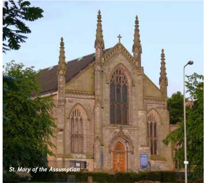
St. Mary of the Assumption

The day will begin with a short walk to a hosted breakfast on the way to a guided tour of St. Giles Cathedral on the Royal Mile. After a hosted lunch we will tour the Edinburgh Castle, including St. Margaret's chapel. Then you will be free to explore the Royal Mile, Holyrood Abbey, and more, before enjoying dinner on your own. This evening we will gather together (specific time and place to be announced) to attend the Edinburgh Royal Military Tattoo on the Esplanade of the Castle. (B, L) Overnight Eliza House, Edinburgh