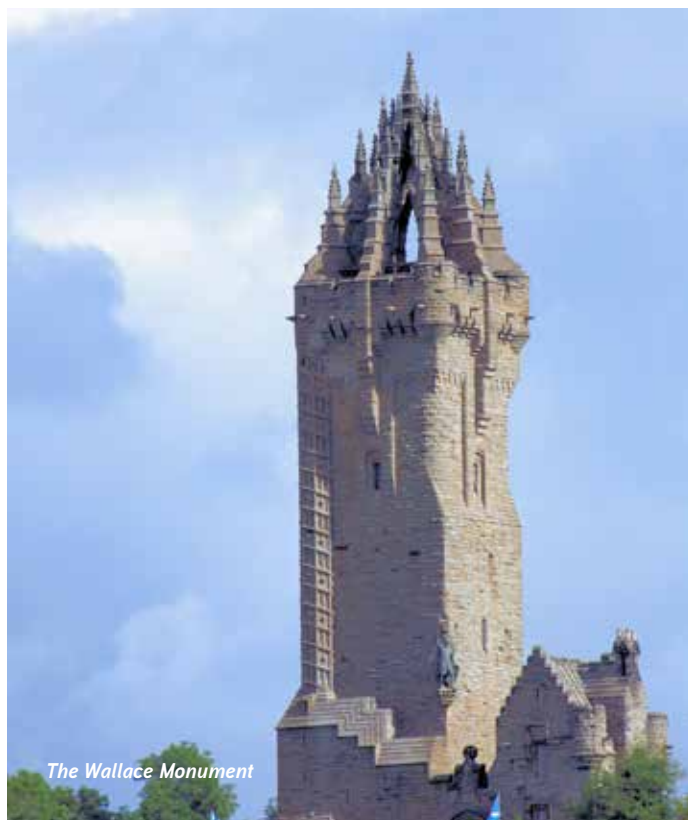
The Wallace Monument

After breakfast, we check out of the hotel and journey together to the train station in Inverness. From here, we take a 3-hour train ride to Stirling. Upon arrival will enjoy a hosted lunch and the Stirling Sightseer Bus. You can get off at any point and back on at your leisure. Points of interest include Stirling Castle, the William Wallace Monument, Statue of Robert the Bruce, and the Bannockburn Battlefield (made famous by the movie Braveheart). Dinner this evening will be on our own.