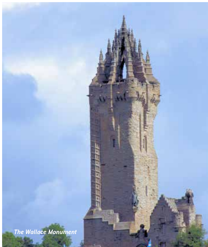
The Wallace Monument

(B, L, Mass) Overnight Lost Guest House, Stirling