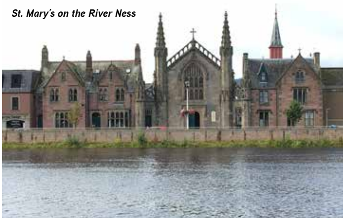
Kitgehrke, CC BY-SA 4.0 < https://creativecommons.org/licenses/by-sa/4.0/ >, via Wikimedia Commons