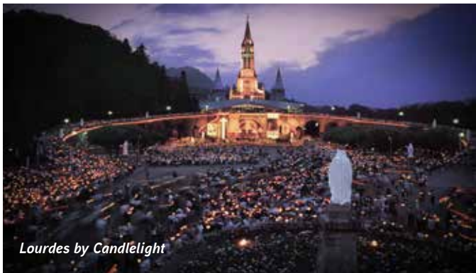
Lourdes by Candlelight